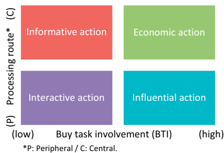
Fig. 2. B2B advertising effects matrix.

advertising to be aware of scenarios where peripheral route processing is activated. On the other hand, B2B marketers can map the advertising consumption experience of buyers to select a particular advertising content for each brand processing situation. Third, the additional consequent behaviors (i.e., interaction with the brand, external WOM, and multiplatform/multichannel exploration) contribute to expanding the advertising measurement control by B2B marketers. Consequently, firms advertising should establish multiple key performance indicators (KPIs), beyond traditional short-term sales effects. Fourth, our model shows that the proposed consequent behaviors affect the advertiser brand equity. Thus, B2B marketers should connect their advertising decisions with financial marketing performance. Practically, this recommendation implies that the brand equity concept should be understood by C-level executives and boards.